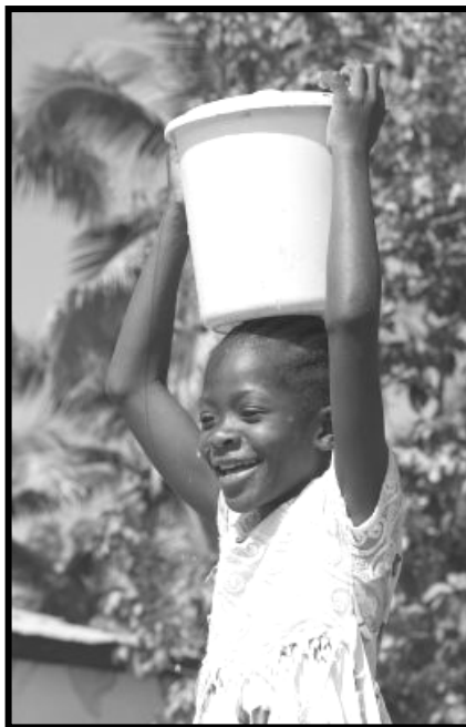
A girl carries water from the well at the Methodist Church compound in Mellier, Haiti.

The Methodist Church also is continuing its search for missing church members who still may be trapped under the rubble. The quake killed as many as 200,000 people and left some 1.5 million homeless, according to news reports.